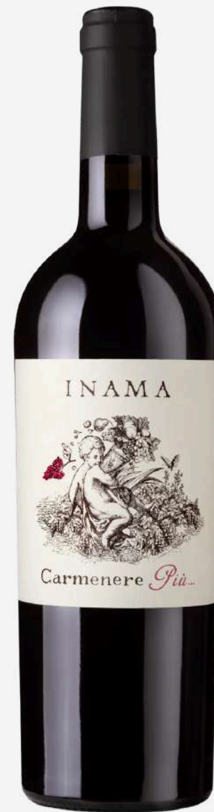
CARMENERE PUI Veneto Rosso I.G.T - Carmenere, Merlot - 12 months in used barriques