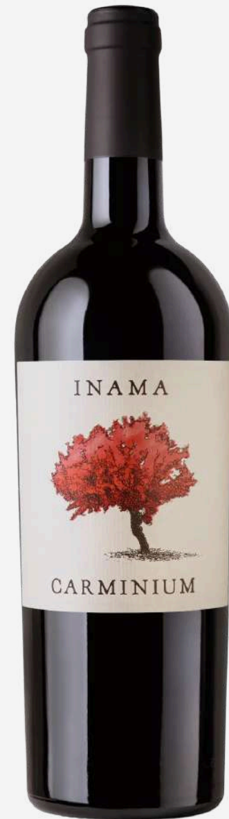
CARMINIUM Colli Berici D.O.C Carmenere - 100% Carmenere, calcareous soil - Aged 12 months, 20% new barrique