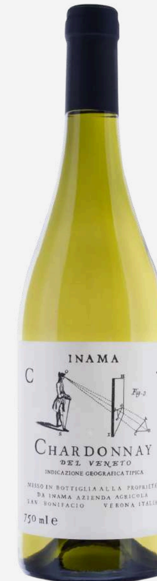
CHARDONNAY Chardonnay Del Veneto I.G.T - 100% Chardonnay coming from volcanic soil and chalky soils - Stainless steel vinification