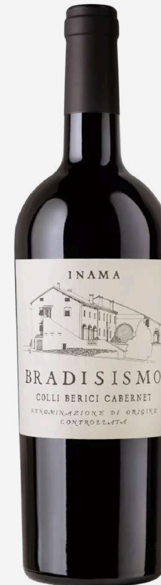
BRADISISMO Colli Berici D.O.C Cabernet - Cabernet Franc, Cabernet Sauvignon, Carmenere - 15 months in 41% new barriques, 59% used