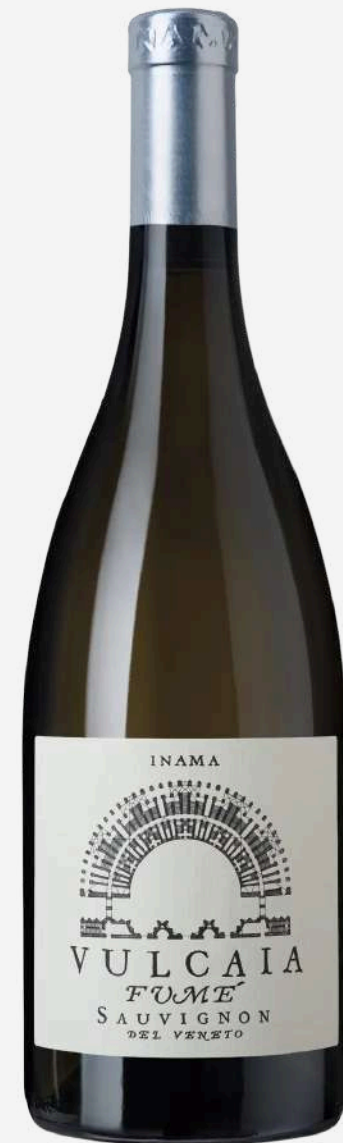
VULCAIA FUMÈ Sauvignon Del Veneto I.G.T - 100% Sauvignon Blanc - Fermentation in 30% highly-toasted new barriques and 70% used