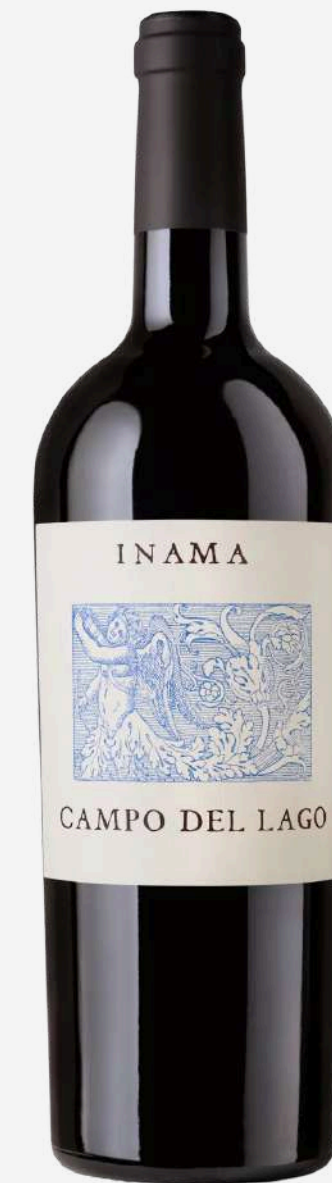
CAMPE DEL LAGO Colli Berici D.O.C Merlot - 100% Merlot - 12 months in first, second and third passage barriques