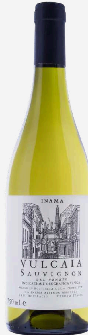
VULCAIA Sauvignon Del Veneto I.G.T - 100% Sauvignon Blanc - Stainless steel vinification