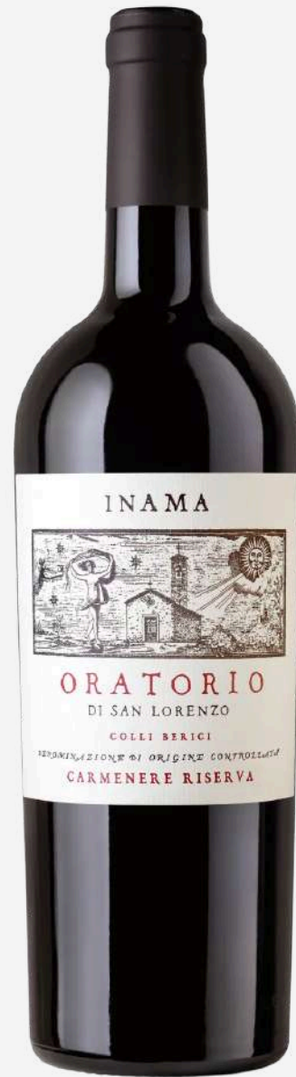
ORATORIO DI SAN LORENZO Colli Berici D.O.C Carmenere Riserva - 100% Carmenere, calcareous soil - Aged for 18 months in mostly new barriques