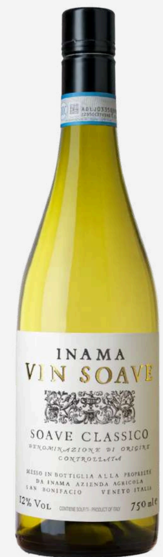
VIN SOAVE Soave Classico D.O.C

Fermentation and ageing for 12 months in stainless steel